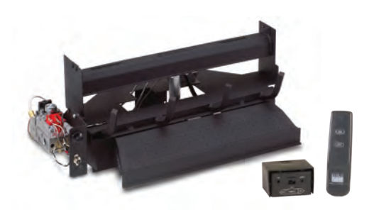
G18-24/30-12 Gas Buner with on/ off remote

If desired, remote control number suffix should be added to the model number following the size indicator (e.g. EFVG18-24-01V).