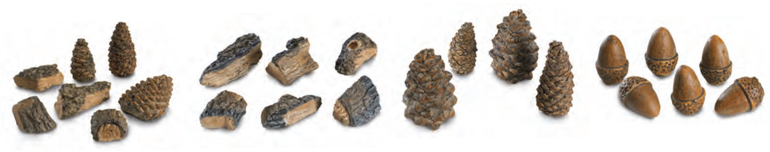
Pine Cone/Wood Chip Decor Pack (DP-2)

Real Fyre premium accessories are the perfect choice to customize your premium log set. We offer a wide variety of accessory options that will compliment any vent-free fireplace. Optional accessories include: Pine Cones, Acorns, and Wood Chip sets, in addition to our array of optional decorative kits. All sets are hand crafted and have the kind of realistic detail that brings that wonderfully authentic feel to any hearth. Choose one, or combine several premium accessory sets to make a hearth that is all your own.