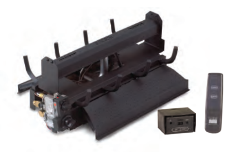
G18-2-24/30-15 See-thru Gas Buner with variable flame height remote