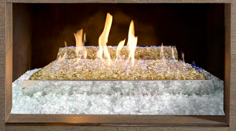
G21-GL-30-12 shown with Gold Reflective Fyre Glass and a Clear Fyre Glass base

The G21 is avialable in an 18", 24", and a 30" burner