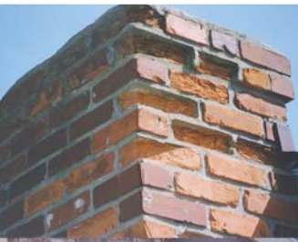
Severe spalling and deterioration is caused by water penetration.

Chimneys are highly exposed to the elements and, if left unprotected, are susceptible to structural deterioration. It is important to address this problem before serious damage occurs. A complete chimney protection program should include repairing the crown with CrownSeal or CrownCoat , as well as waterproofing the entire chimney with ChimneySaver water repellent.