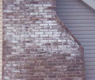
Efflorescence stains caused by water penetration and leaching salts are unsightly and add to deterioration.