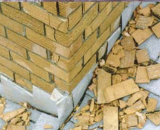
Water penetration and freeze/thaw damage result in loss of insulation value and lead to structural failure.